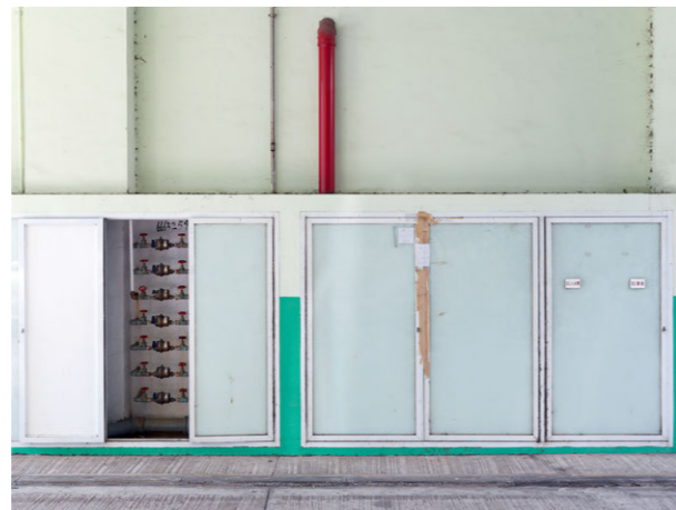
Horizon #68, (Macau), 2014