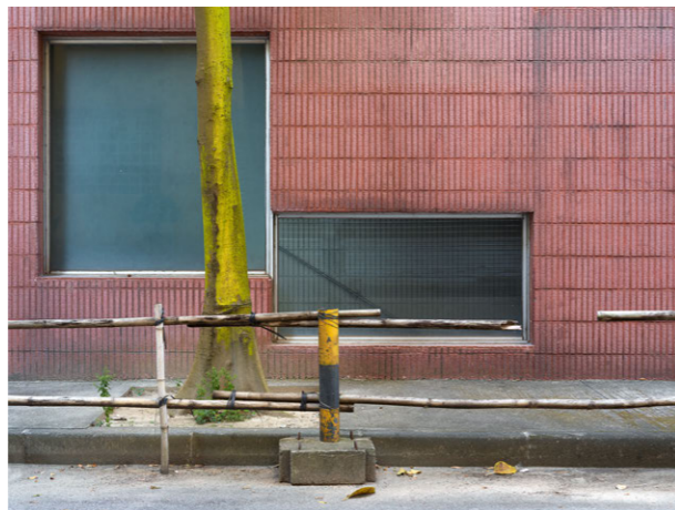
Horizon #69, (Macau), 2014