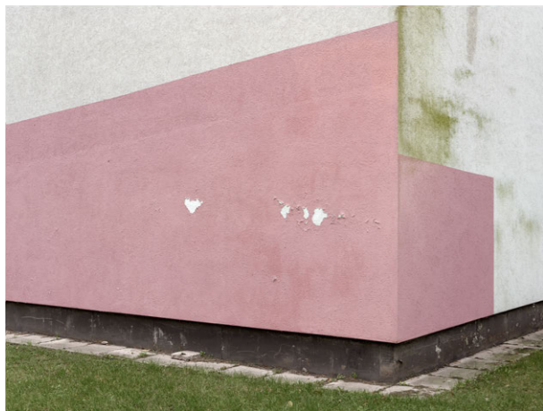
Horizon #16 (Lodz), 2014